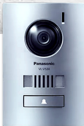
VL-V524LCE 1.3MP SENSOR Door Station