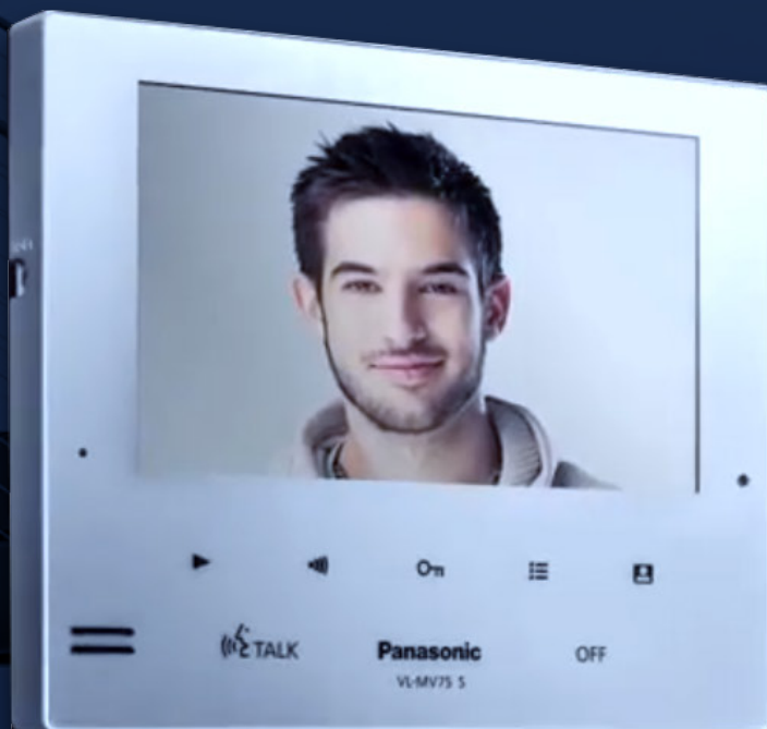
VL-MV75AZ-S 7" INCH MONITOR Silver