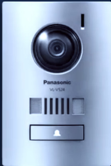
VL-V524LCE 1.3MP SENSOR Door Station