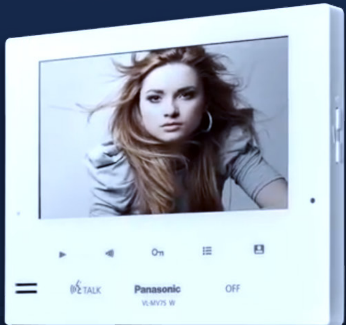
VL-MV75AZ-W 7" INCH MONITOR White