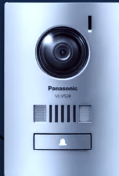
VL-V524LCE 1.3MP SENSOR Door Station