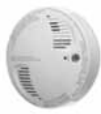
Wireless Carbon Monoxide Detector