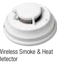
Wireless Smoke & Heat Detector