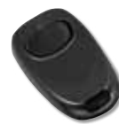
1 Button Wireless Personal Panic Key