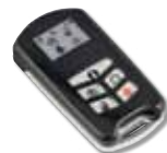
2-Way Wireless Key