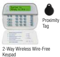
2-Way Wireless Wire-Free Keypad