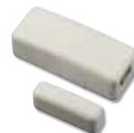
Wireless Door/Window Contact